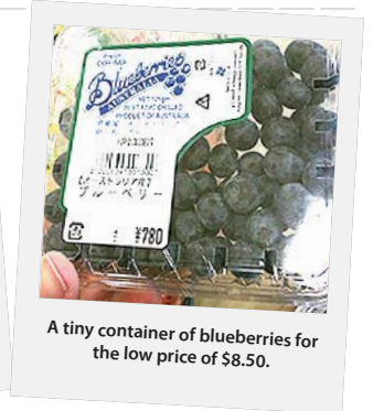
A tiny container of blueberries for the low price of $8.50.

Return with a check to: Team Expansion 2401 The Oaks Blvd Kissimmee, FL 34746