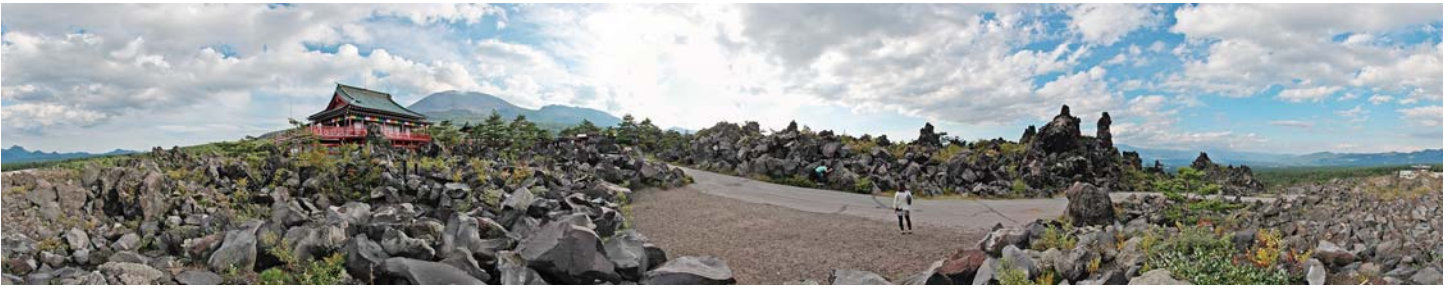
Mt. Asama as seen from the north side at Onioshidashi Park. The majority of the large rocks here came from an eruption in 1783.

Mark 4:16-17 Others, like seed sown on rocky places, hear the word and at once receive it with joy. But since they have no root, they last only a short time. When trouble or persecution comes because of the word, they quickly fall away.