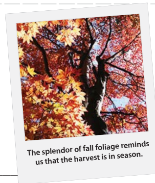
The splendor of fall foliage reminds us that the harvest is in season.