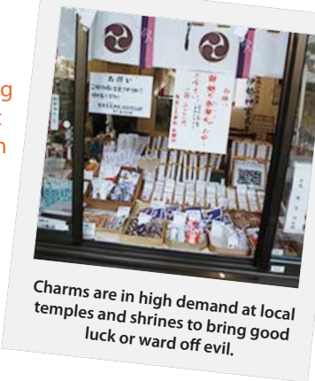
Charms are in high demand at local temples and shrines to bring good luck or ward off evil.