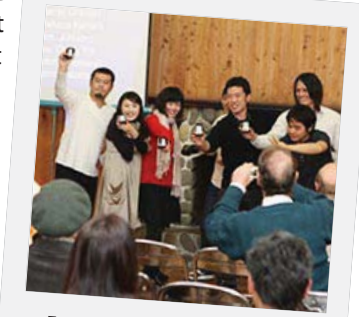
English students at SYME were recognized for their progress since summer. Many believe in Christ.