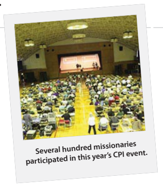
Several hundred missionaries participated in this year's CPI event.