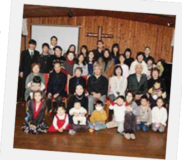
We are happy to attend weekend service at Horizon Chapel where our kids normally have school.

When you buy a loaf of bread in Japan, the heels have already been removed. You can buy bread with the crusts already cut off too.